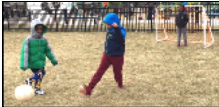
New soccer goals and field trip coolers!